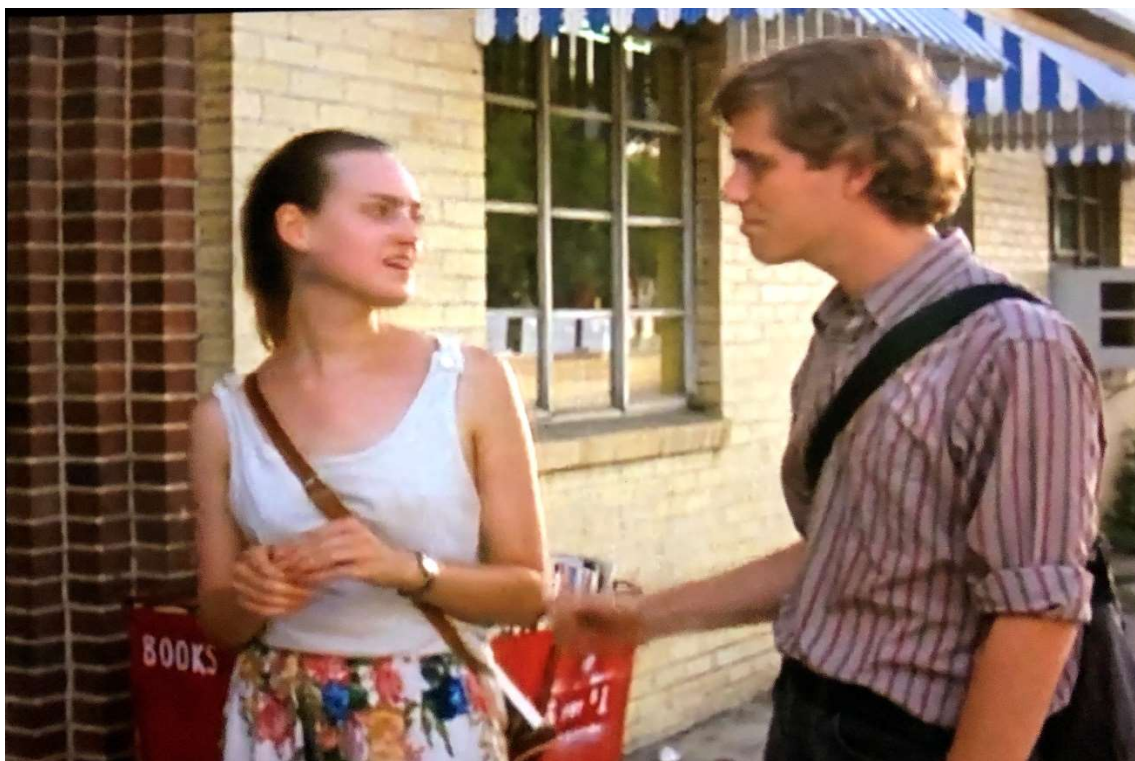
3110 Guadalupe St.