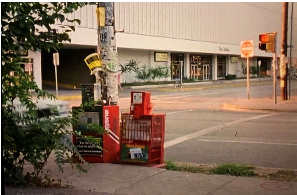
Corner of 24th St. and San Antonio St.