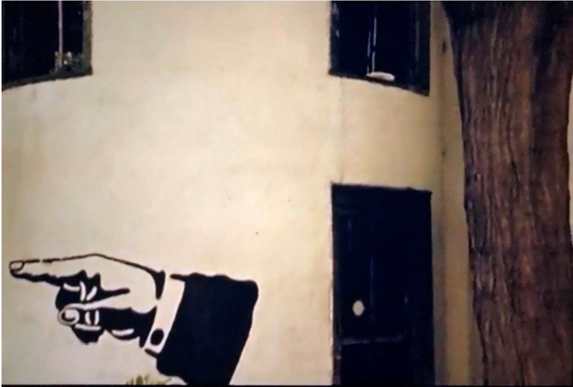
2505 Nueces St.