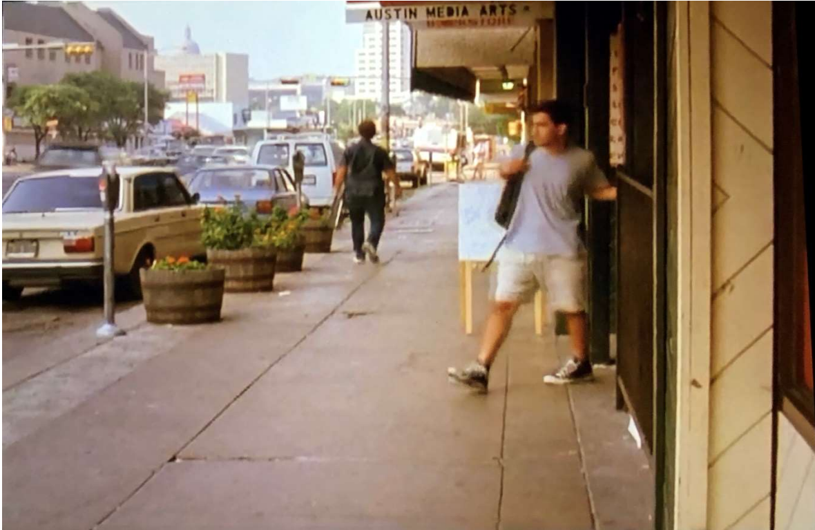
West Side of the 2100 Block of Guadalupe St.