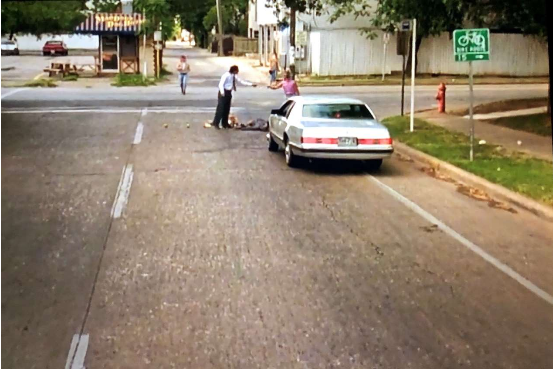
Nueces St. at 24th St.