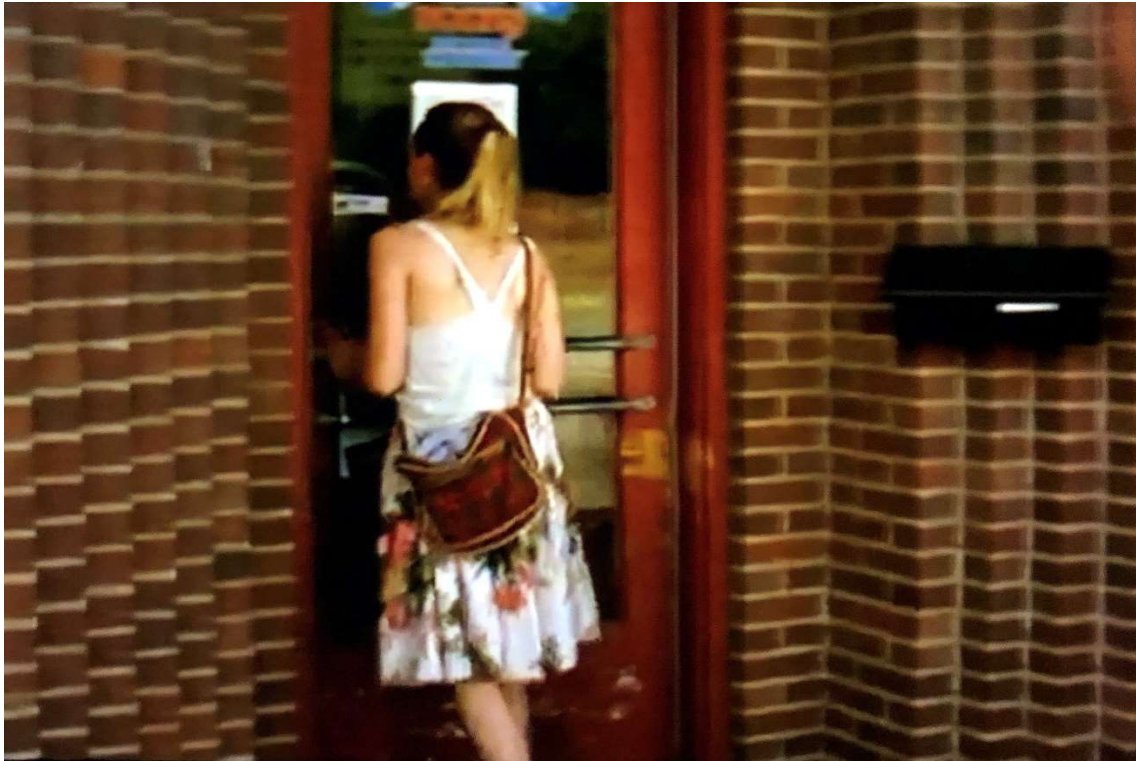
3110 Guadalupe St.