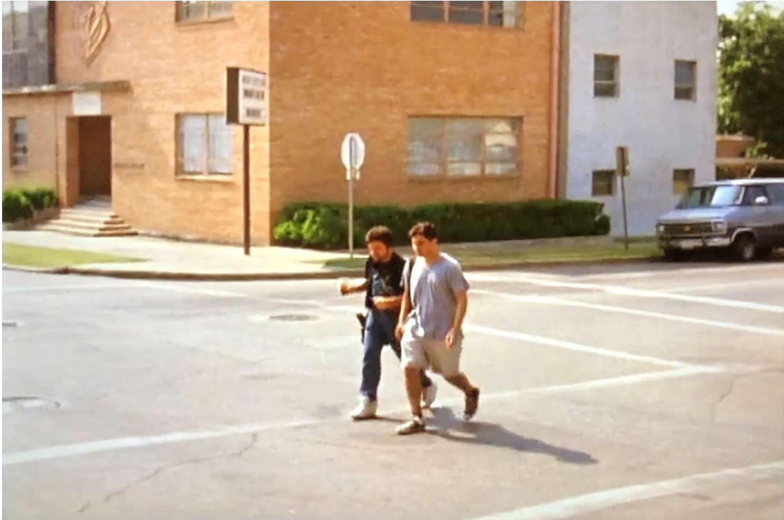
Southeast Corner of 22nd St. and San Antonio St.