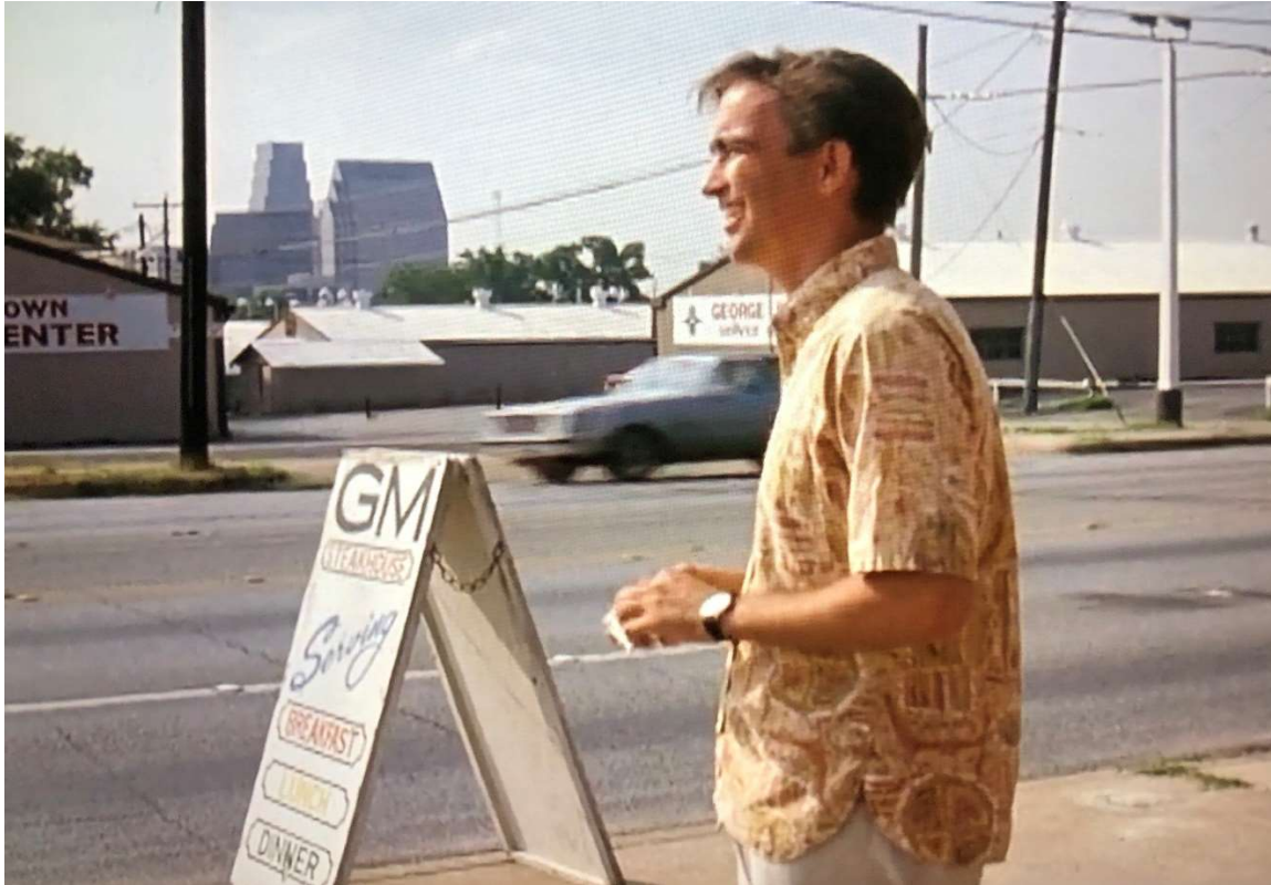
626 North Lamar Boulevard