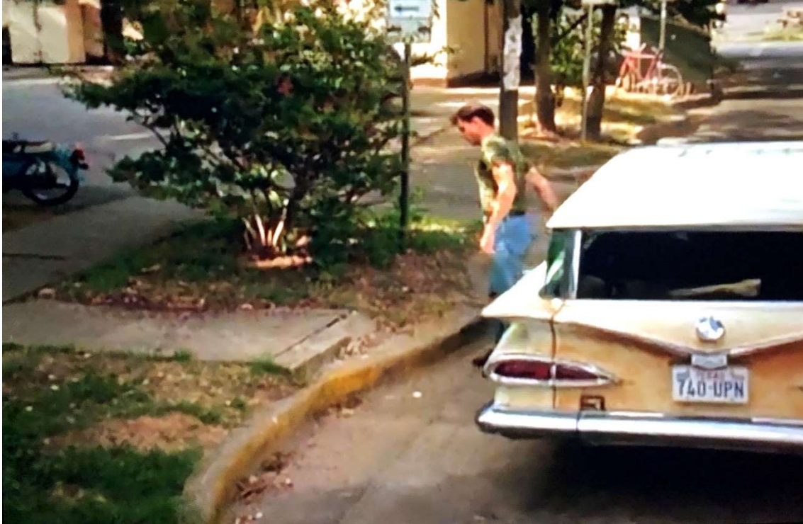
2405 Nueces St.