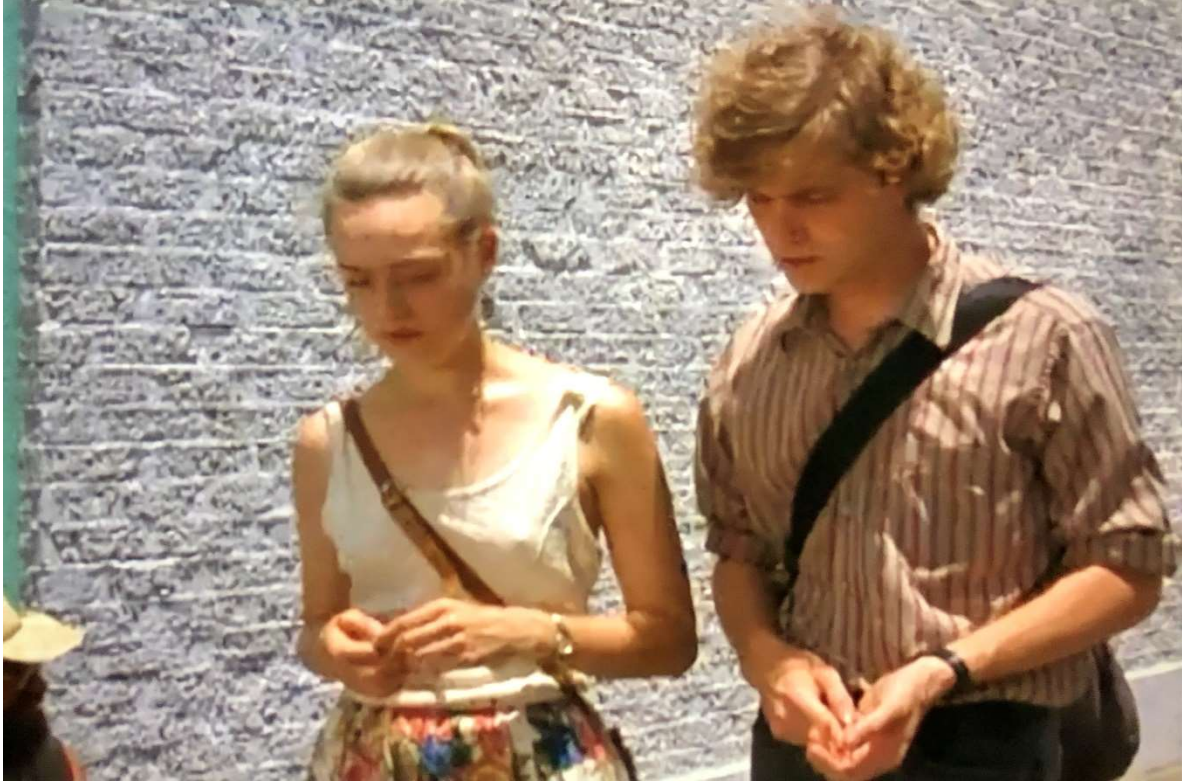
Northwest Corner of 21St. and Guadalupe St.