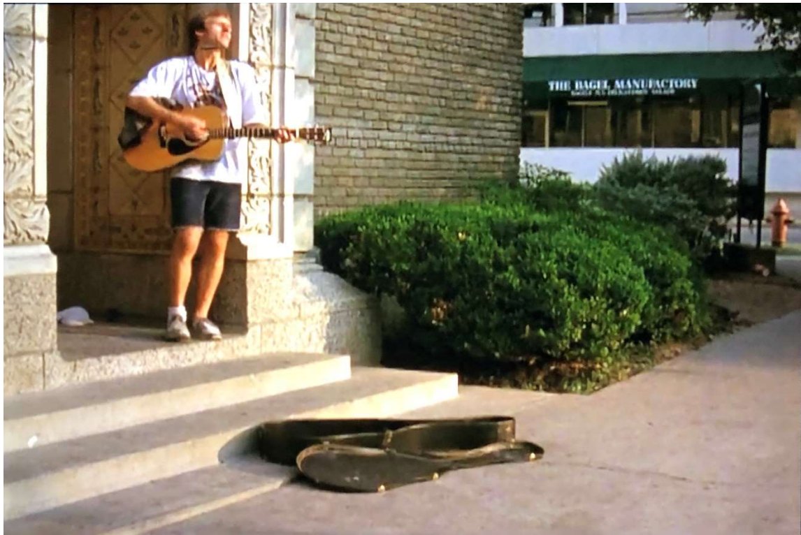
Southwest Corner of Guadalupe St. and 22nd St.