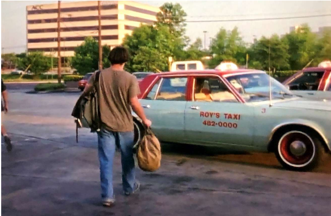
5900 Middle Fiskville Road