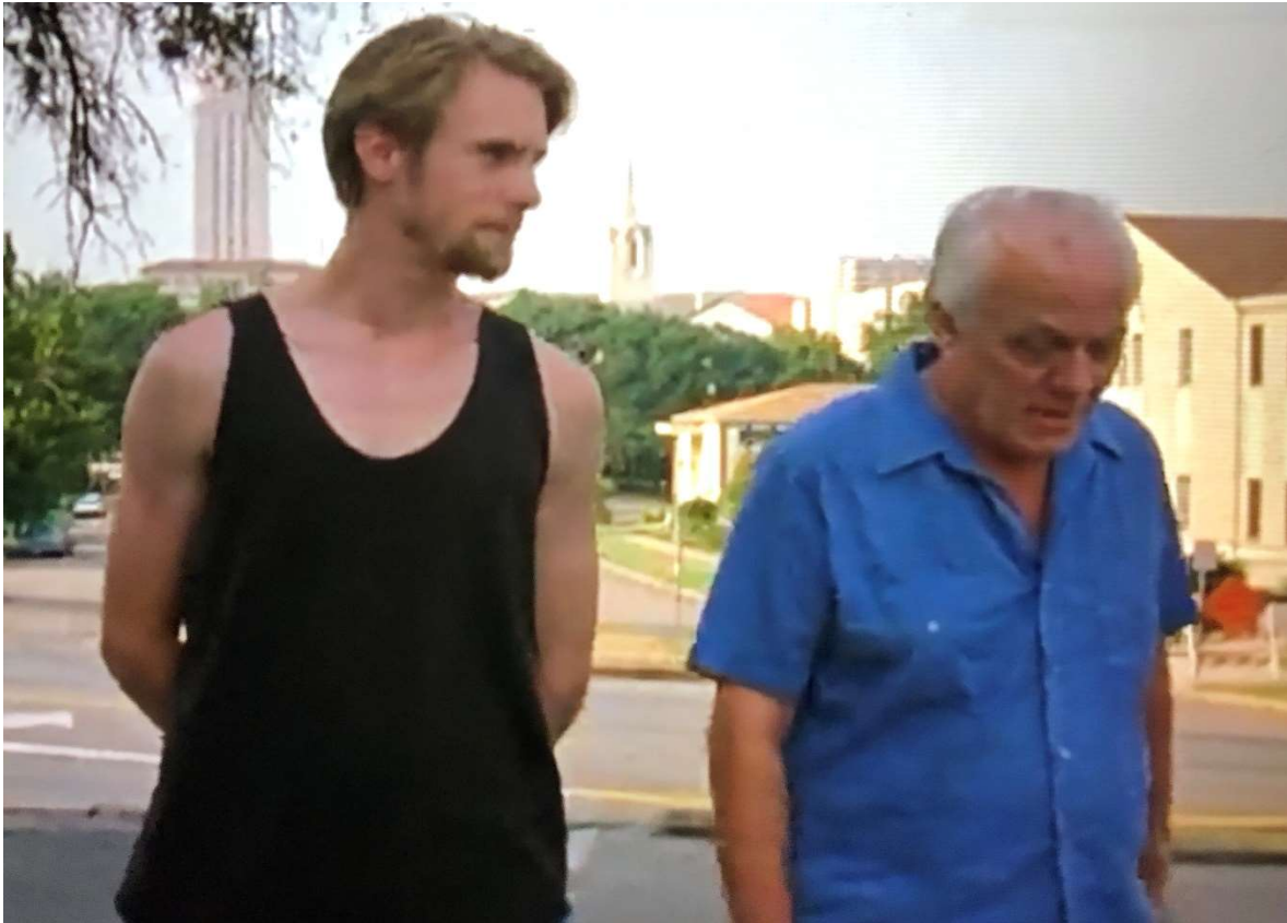
MLK Boulevard at University St. Looking North