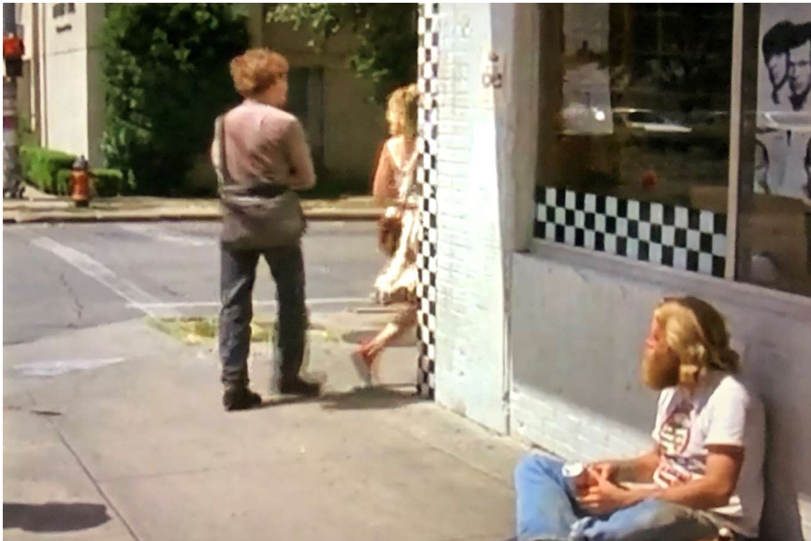
Northwest Corner of Guadalupe St. and 21st St.