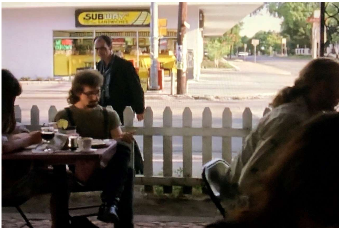
24th St. at San Antonio St.