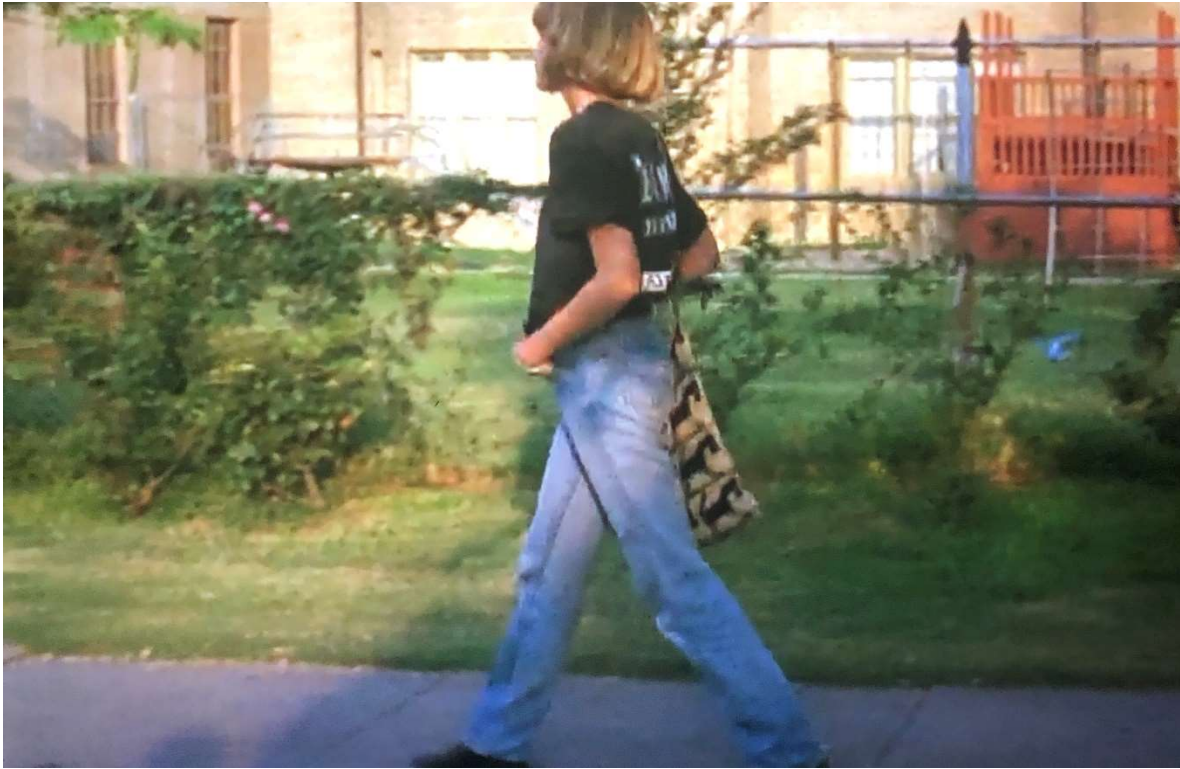
West Side of 2100 Block of Guadalupe St.