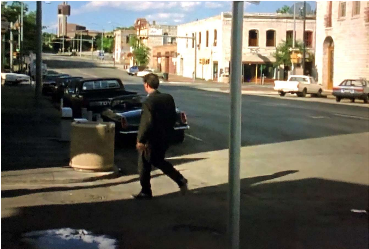
6th Street and Brazos St. View North