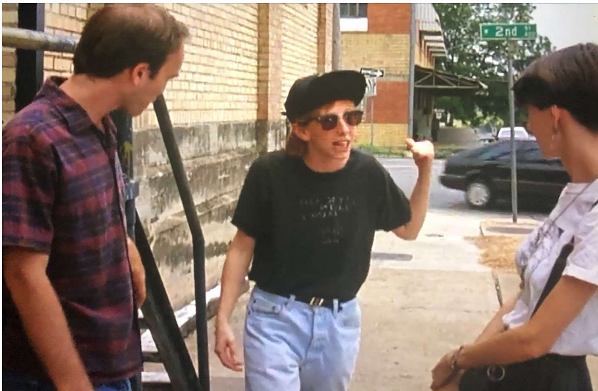
"Madonna's Pap Smear" 400 Guadalupe St.