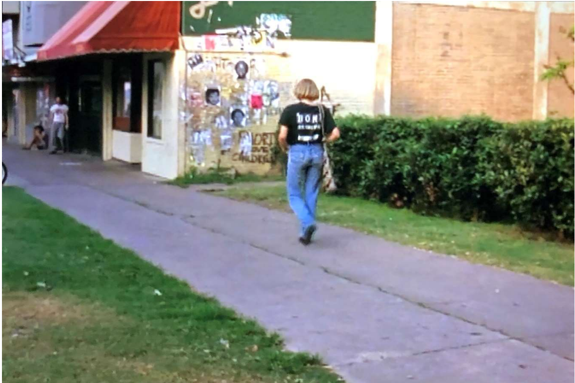
West Side of 2100 Block of Guadalupe St.