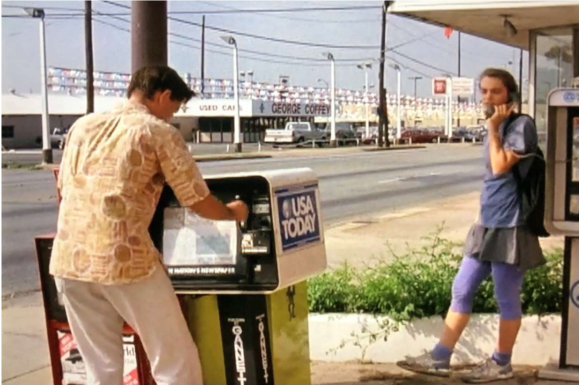
626 North Lamar Boulevard