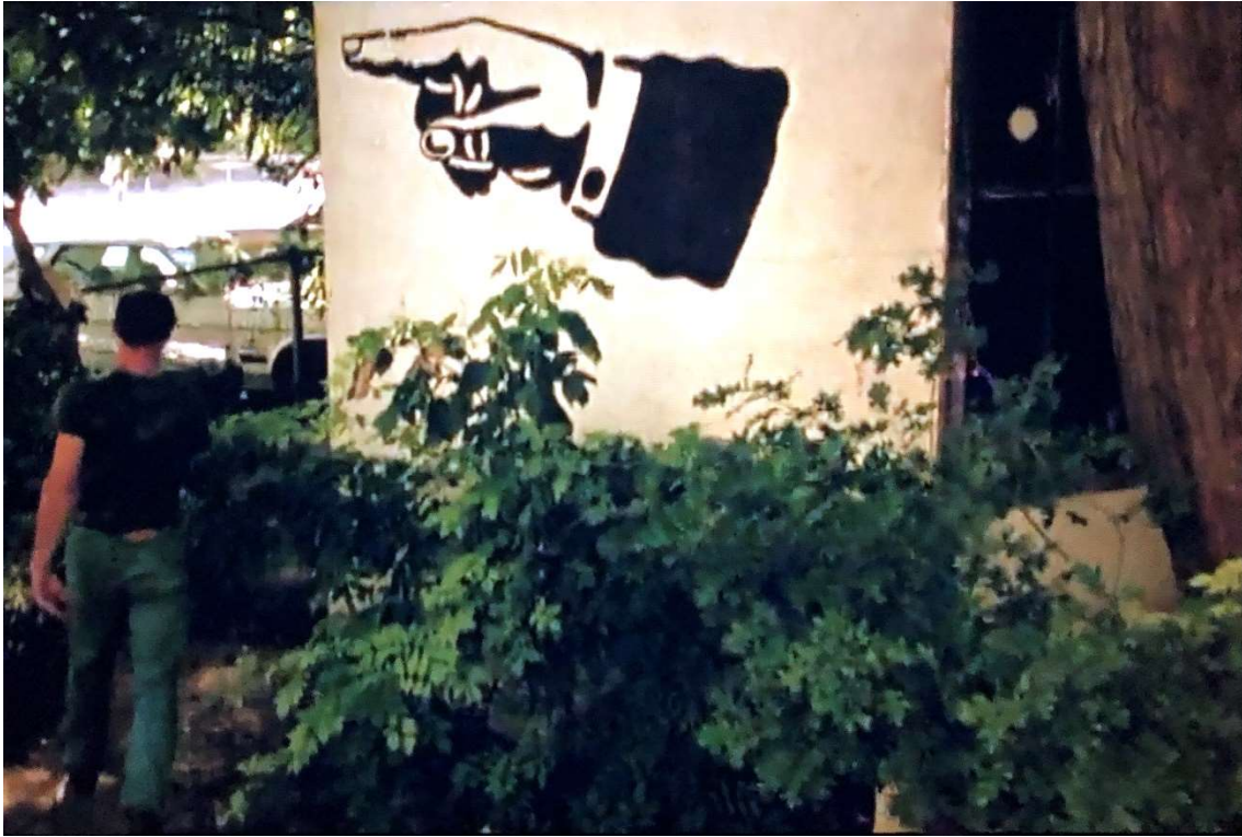
2405 Nueces St.